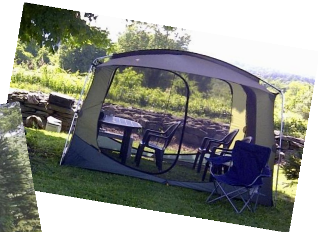
K1ZE & N1MD tents.