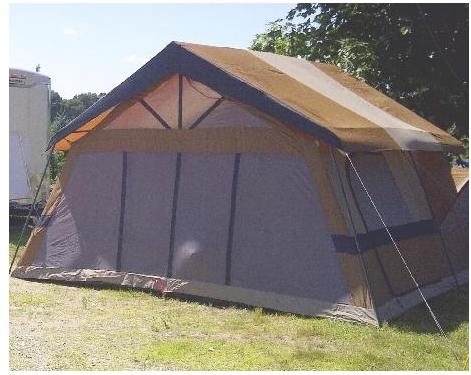
Event power provided by twin Honda generators (top left). Solar backup power for KB1JQA trailer (top center). KB1JQA/KB1JDX/KB1LYF tent (top right).