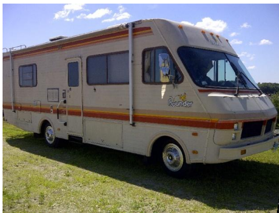
K1AGL RV GOTA station (left).