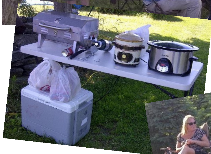
Lots of food & great pot luck dinner.