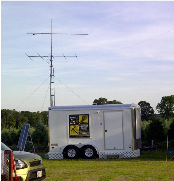
KB1JQA trailer (above) & literature table (right). KB1DNO & KB1JDX organizing literature table (below).