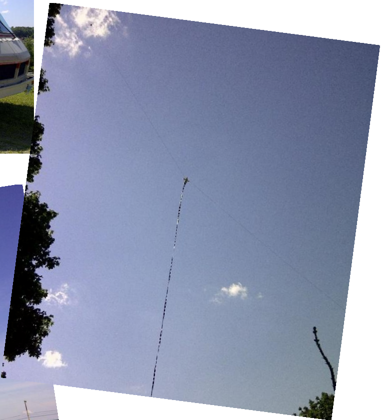
HF Antennas, one using 40ft support pole rather than a tree.