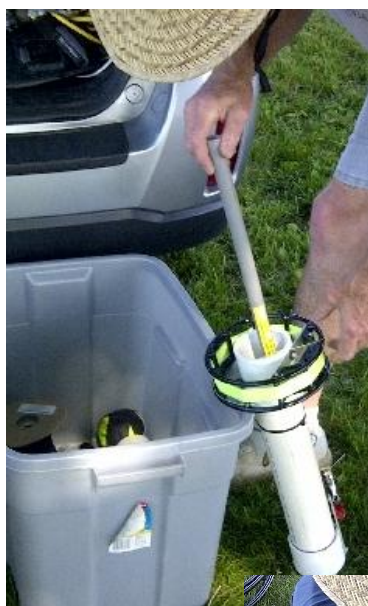
K1ZE loading his antenna stringing bazooka (left); pressurizing the bazooka (lower left); checking line reel assembly for proper feed (upper right); firing bazooka over tree-top (lower right).